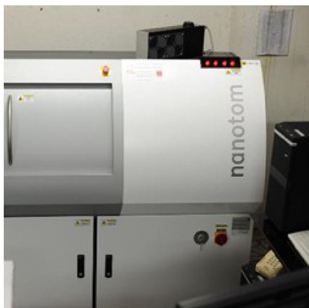
Phoenix Nanotom 180 scanner used at the CIRIMAT

This non-destructive technique records digital 3-D morphological data, to be used for further analysis.