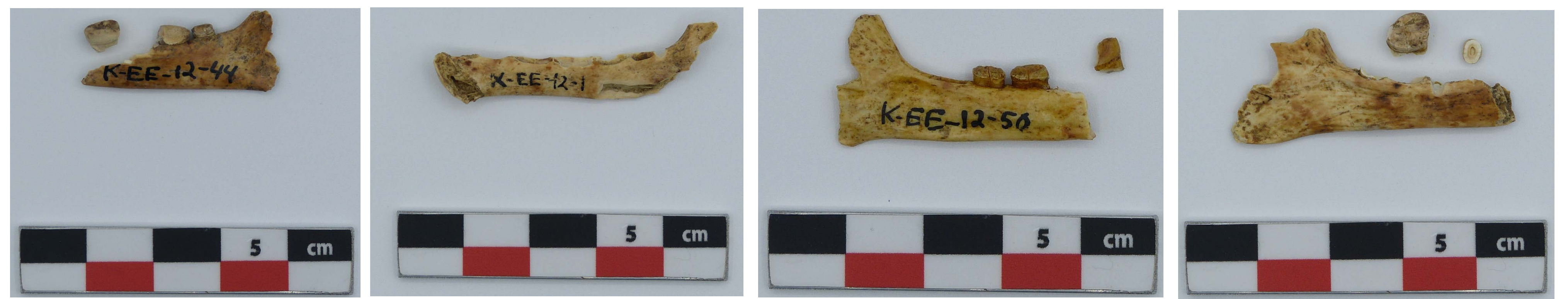
Mandible of A. bulmerae dated to between 10000 to 12000 years BP used for this study analyses.

Four mandible fragments from A. bulmerae were sent from the Univ. of Papua New Guinea to the CNRS (Univ. of Toulouse, France) for analysis.